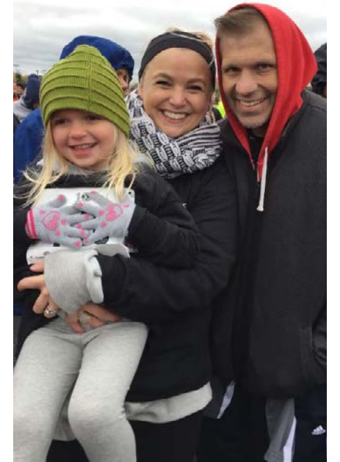
"She's nine, and I'm still here."

He and his extended family continue to advocate for Gilda's Club to ensure that no one faces cancer alone. You'll see them among our top fundraising teams at Gilda's Run/Walk year after year.